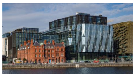
Adare Office Asset – Dublin, Ireland