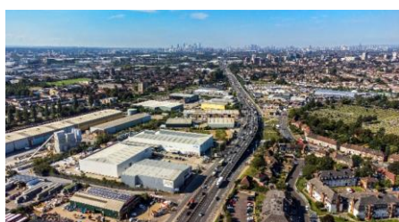
Mileway – Pan-European

Your capital is at risk and you may lose some or all of your investment. There can be no assurance that the Fund will achieve its objectives, pursue any particular theme or avoid substantial losses. Past performance does not predict future returns. The figures herein include preliminary, unaudited results, which are subject to further review and adjustment. The use of leverage or borrowings magnifies investment, market, and certain other risks and may have a significant impact on returns, resulting in the partial or total loss of capital invested. The share redemption plan is subject to certain limitations (including the 2% of NAV monthly redemption limit and the 5% of NAV quarterly redemption limit) and BEPIF may make exceptions to modify, suspend or terminate the program. Dividends are at the Board of Directors' discretion and are not guaranteed.