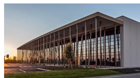
Luna Logistics Portfolio – Italy

Note: When used in this document and unless otherwise specified or unless the context otherwise requires, references to the "Fund" should be read as references to Blackstone European Property Income Fund SICAV ("BEPIF"), Blackstone European Property Income Fund (Master) FCP and their parallel entities. The inception date for Class I-A, Class I-D, Class A-A and Class A-D shares is October 1, 2021. Different investor eligibility requirements and minimum subscription amounts may apply in certain jurisdictions. Please refer to page 3 for more information on BEPIF's performance. Please refer to page 4 for additional sourcing and disclosure information. 1-3. Please refer to page 4 for relevant endnotes.