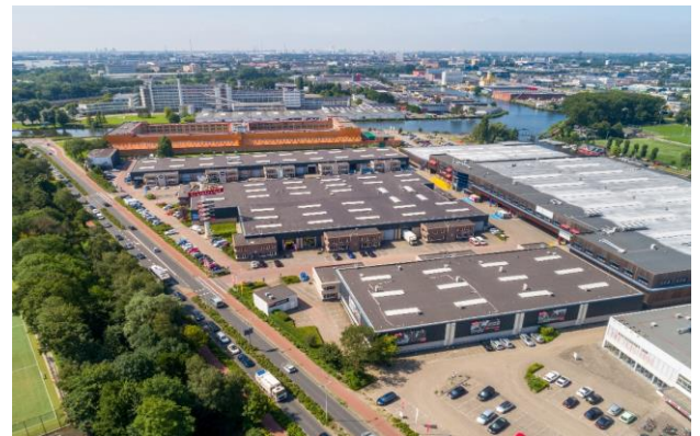
Mileway - Pan-European

35k portfolio company employees providing us proprietary insights in Europe