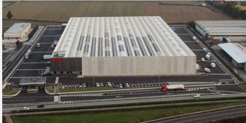
Luna Logistics Portfolio, Italy

rent growth in BEPIF's markets since inception (3)