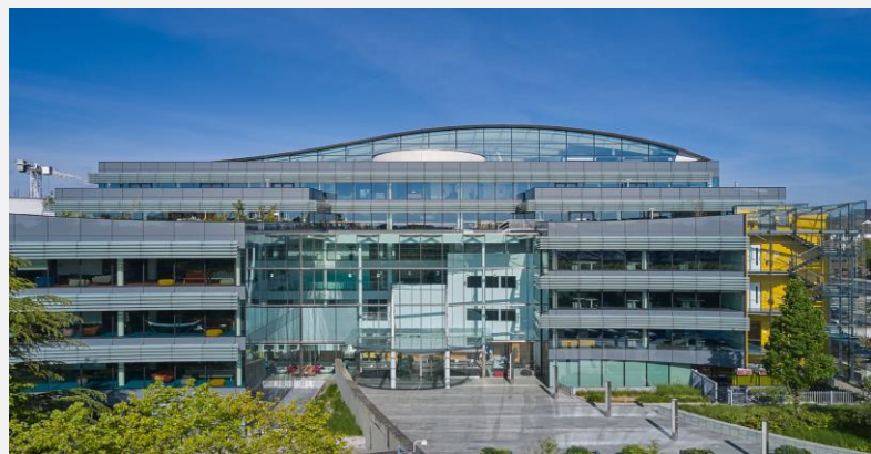
Infinity Office, Ireland

rent growth in BEPIF's markets since inception (4)