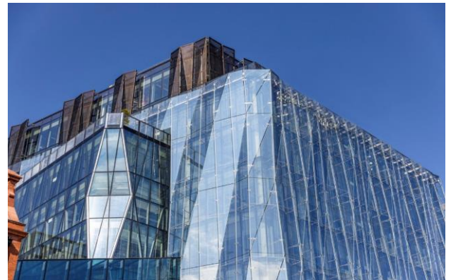
Adare Office Asset - Dublin, Ireland

Past performance does not predict future returns. Your capital is at risk and you may lose some or all of your investment. There can be no assurance that any Blackstone fund or investment will achieve its objectives or avoid substantial losses.